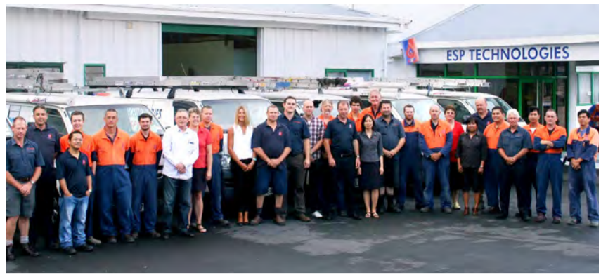
The Aquaheat Facilities Services Whakatane team